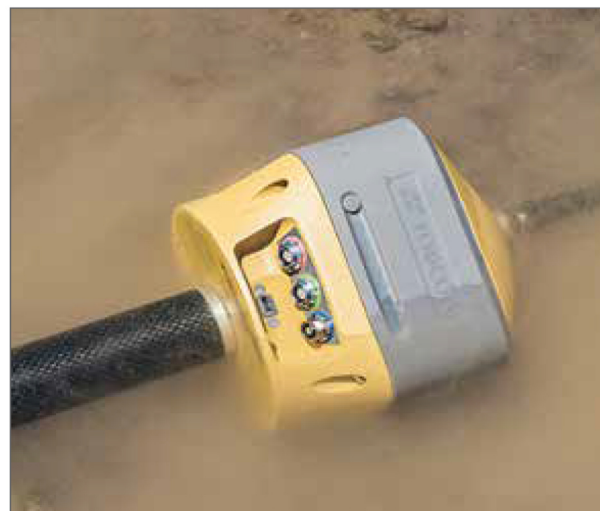
IP67 Waterproof Rating

Awkward shots on steep slopes or hard to reach spots are now a breeze with TILT™.